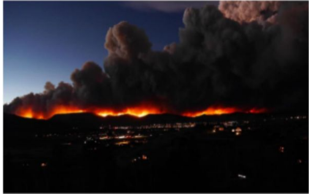
East Troublesome Fire, October 2020