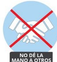
NO DÉ LA MANO A OTROS

Estornude o tosa. en un pañuelo de papel o en el codo; coloque los pañuelos usados en la basura