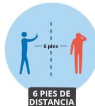
6 PIES DE DISTANCIA

Evite esta área si tiene tos o fiebre o si experimenta síntomas del virus.