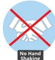
No Hand Shaking

Sneeze or cough into a tissue, or into your elbow; place used tissue in the trash